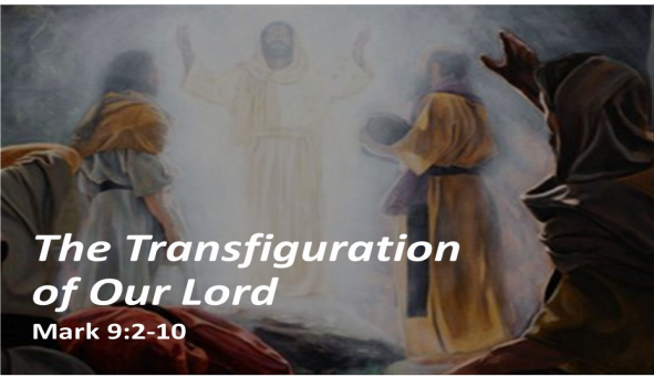
The Transfiguration of Our Lord Mark 9:2-10