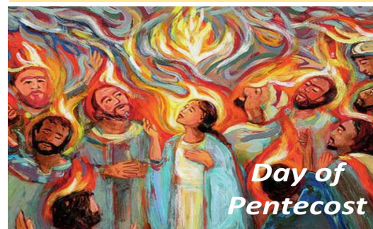
Day of Pentecost

Order forms ~ on table in narthex ~ cost ~ $40 per vase ~ there are 2 vases